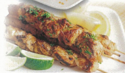
Chicken Breast Kebob